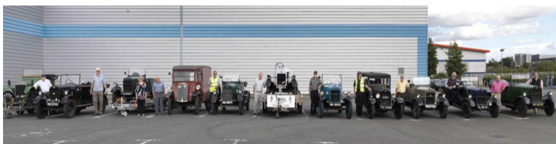
Toys R Us car park off Purley Way, Croydon (site of the Trojan factory)

While Trojan progress took a back seat and missing the original completion date for a working Trojan by a mile, I decided that PK 2613 had to attend our Centenary celebrations on 18 th August. Borrowing a trailer from my neighbour and fitting a winch, my Trojan was hauled aboard and with insurance provided by Hagerty we set out for Croydon. The photograph below shows us in the centre of the group who attended in the Toys R Us car park off Purley Way, Croydon (site of the Trojan factory) with ten Trojans in attendance.